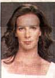
SPOTLIGHT . . . above and left, the majestic Paronella Park and, above, Shirley MacLaine and Rachel Griffiths top the director's wish list