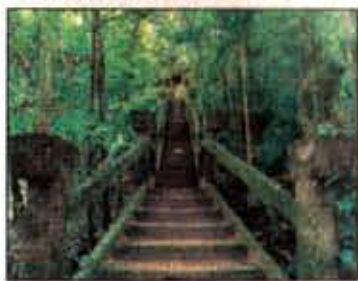
The grand staircase

foundations remain as testament to their extraordinary effort.